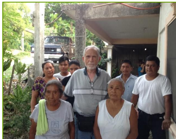
With the brethren in Tempoal, Veracruz