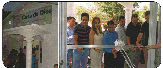
Bottom right: inauguration of new church